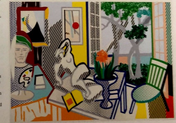
Roy Lichtenstein, Bellagio Hotel/Mural: Still Life with Reclining Nude (Study), 1997, cut-and-pasted, painted, and printed paper on board, 40 1/4 x 60 1/4 inches (102.9 x 153 cm)