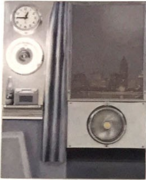
Tom Wesselmann, Interior #2, 1964 , acrylic, collage, assemblage including working fan, clock, and fluorescent light, 60 x 48 x 5 inches (152.4 x 121.9 x 12.7 cm) © Estate of Tom Wesselmann/Licensed by VAGA, New York

A series of new works by Edmund de Waal, inspired by the writings of Voltaire, are on view at Espace Muraillie and the recently restored eighteenth-century apartment building above.